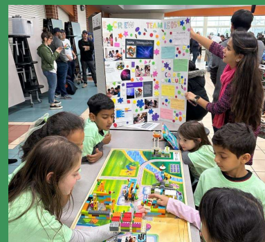
FIRST Lego League Explore Grades K - 3