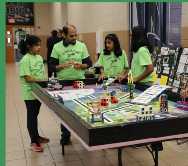
FIRST Lego League Challenge Grades 4 - 6