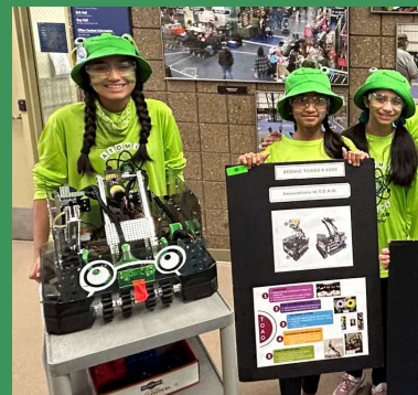
FIRST Tech Challenge Grades 7 - 8